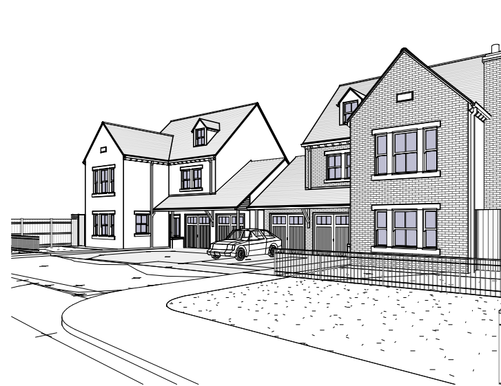
3D View 1