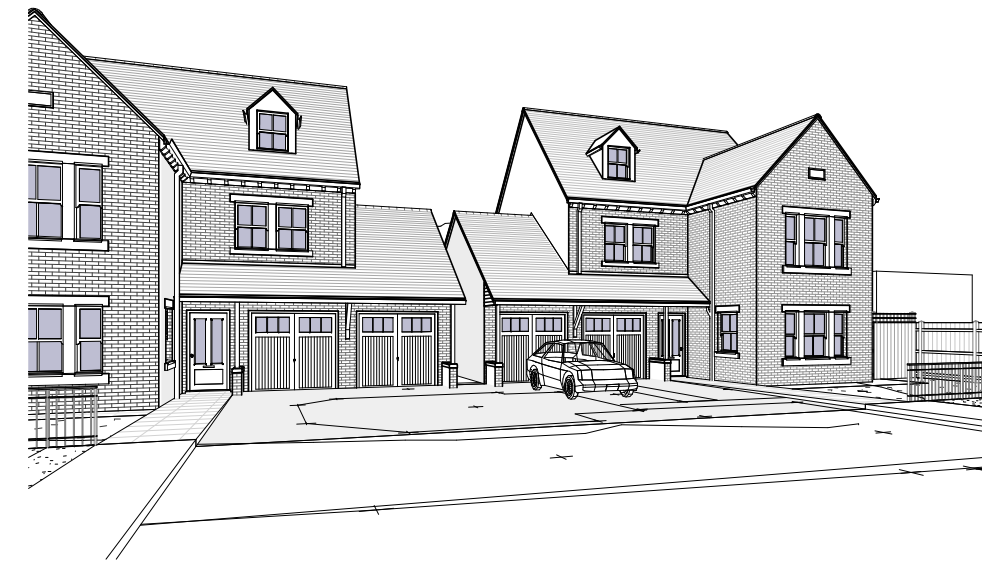
3D View 2