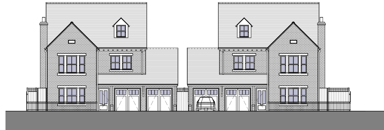
Front Elevation 1 : 200